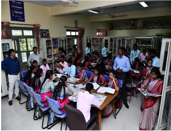
Well-furnished fully automated library