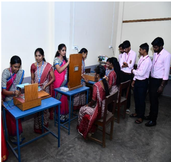
Psychology lab with well-furnished apparatus