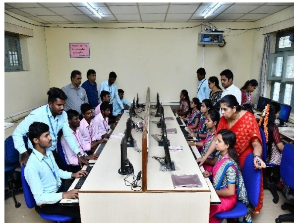
Computer lab with LAN