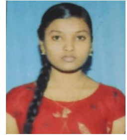
Uma D.N. 89.95% V Place