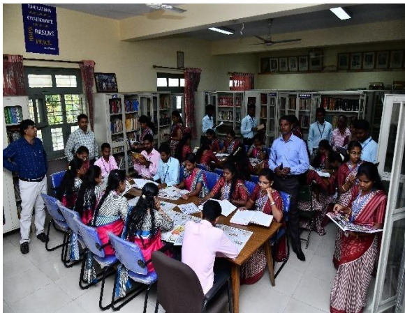
Well-furnished fully automated library