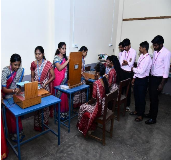
Psychology lab with well-furnished apparatus